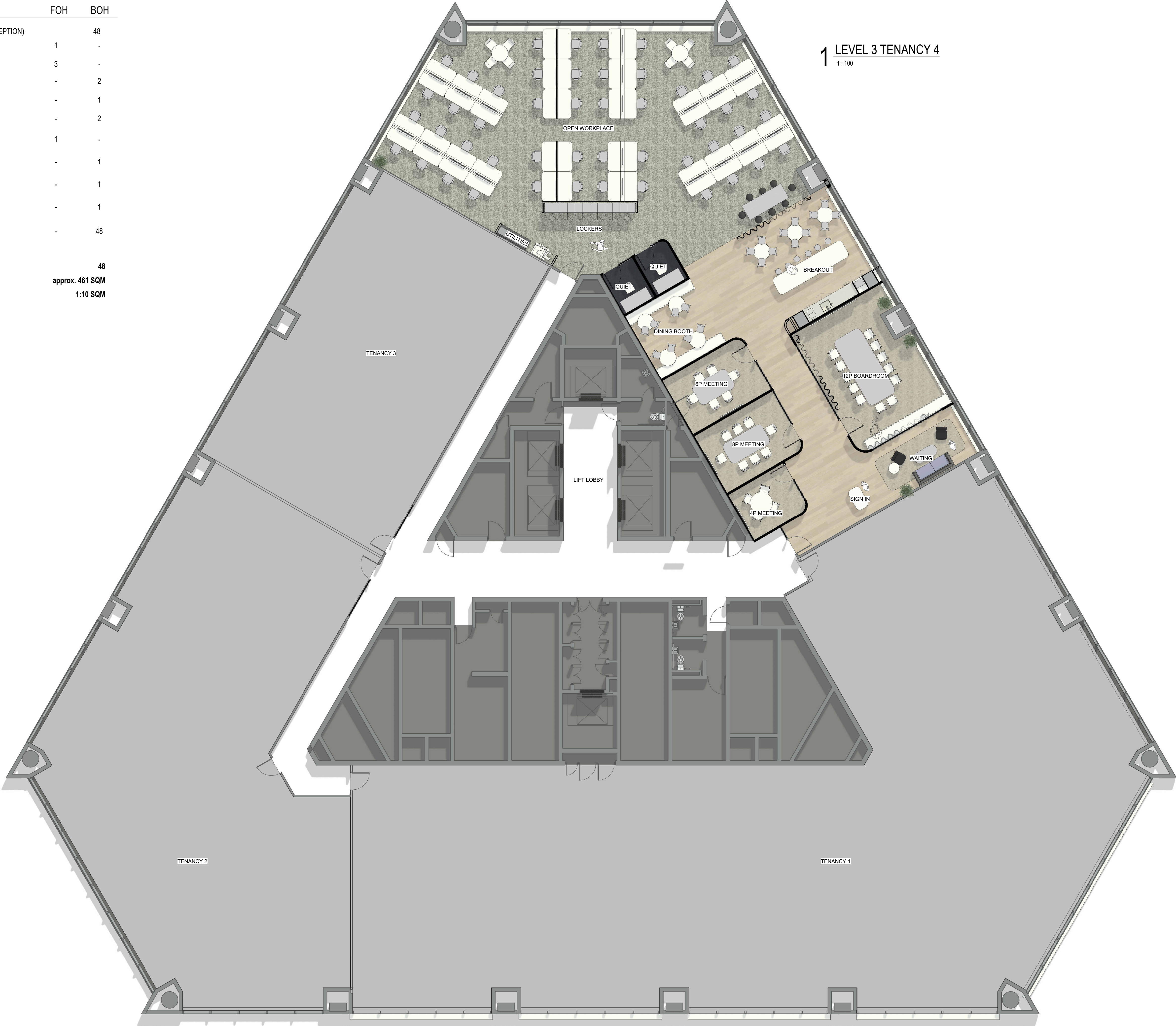
1 LEVEL 3 TENANCY 4 1:100